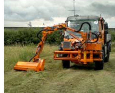
Mowing of a hard-to-reach roadside using a WWP500U multifunction arm and GK 110 head.