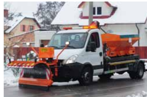
PU S25H snowplow with EPT 15 salt spreader on a hooklift frame